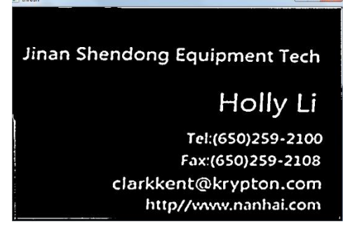
Figure II. Binarization

2)Median filtering method: Select an odd-point sliding window W, traverse the image with the window, sort the selected pixel points in the window, take out the gray value in the middle to replace the gray value of the pixel points, can be described as: