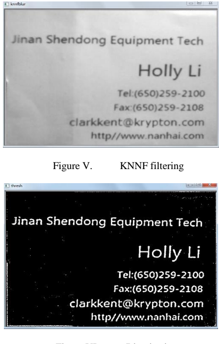
Figure VI. Binarization

the closest K adjacent pixels. As shown in Figure 5 and Figure 6: