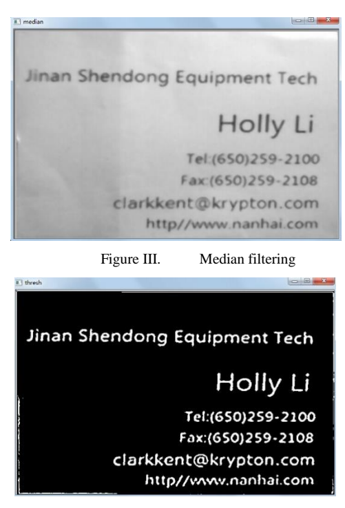
Figure IV. Binarization

The neighborhood average method uses a low-pass filter to suppress the noise, but the image edge usually contains a large amount of high-frequency information. Therefore, while denoising, the smoothing operation also blurs the image boundary, which is the most effective for eliminating the isolated points, line segment pulse interference and image scanning noise [2]. As shown in Figure 3 and Figure 4: