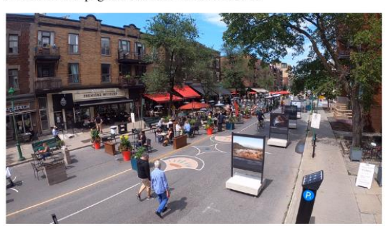
Site 3a: Champagneur and Outremont avenues