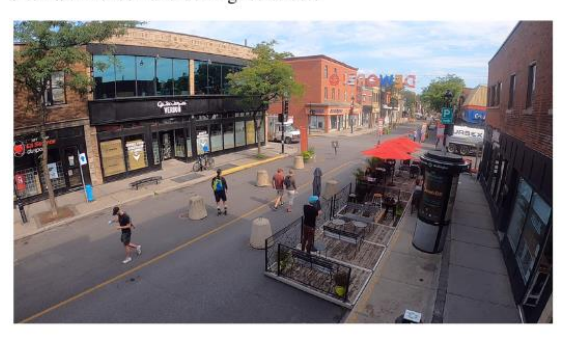
Site 3a: Champagneur and Outremont avenues