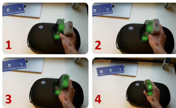
Fig. 1 The teleoperation concept. Frames 1-3: follower matches the virtual probe precisely, starting in a random pose. Frame 4: the expert moves the virtual probe, and the real one quickly tracks the motion.

The tele-US system consists of the follower side and the expert side, which communicate wirelessly over the Internet. The follower wears a mixed reality (MR) headset (HoloLens 2 in our implementation) which projects a virtual US transducer into the follower’s scene. The expert controls the virtual probe using a haptic controller (Phantom Desktop, 3D Systems, Inc.) to input the desired pose and force. The follower tracks the