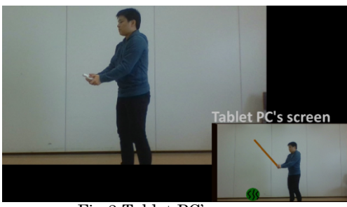
Fig.3 Tablet PC's screen

The play will terminate when a certain period of time has passed.