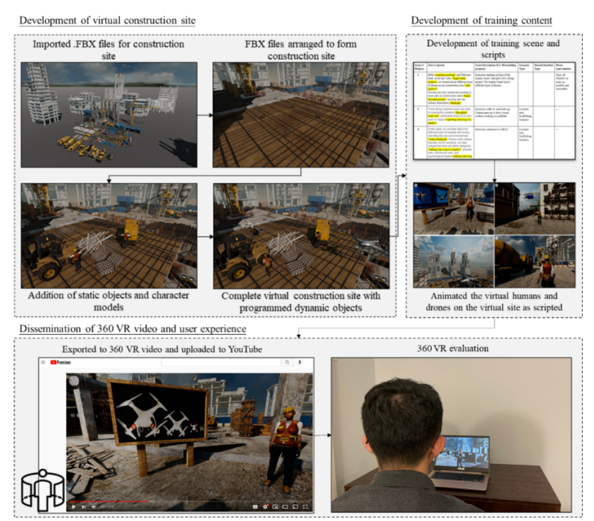
Figure 2. 360 Development of 360 video

Following the design of the content structure, the 360 VR training material was developed using the Unity game engine with design and scripting capabilities. The process of 360 VR development (see Figure 2) consists of three steps: (1) Development of virtual construction site; (2) Development of training content; and (3) Dissemination of 360 VR video.