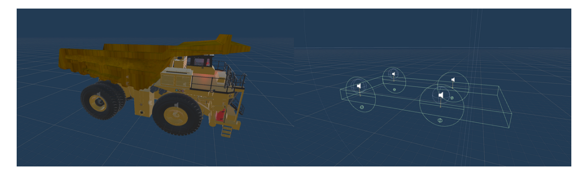
Figure 2: The mining dump truck's Visual Layer (left) and Input Layer (right).

Instead of only needing to translate input for a human body, we also had to synchronize several properties associated with a mining dump truck whose Visual and Input Layers are depicted in Figure 2. This caused us to realize the inadequacies of our original fixed pose-slot mapping and led to its replacement with the current dynamic system.