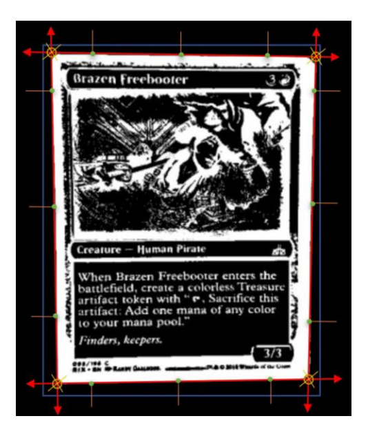
Figure 4: Corner x, y coordinates are calculated using edge detection algorithm.

Card edge detection was achieved with a custom algorithm that finds the card's border, calculates the formula for the line of that edge, and finds the x, y coordinates for each corner. This algorithm was contained within a class to allow for different referenceable coordinate types (AForge IntPoints and System.Drawing PointF) and detection failure flags. These flags were triggered if the corner angles were out of an acceptable range of 90^{\circ} \pm 10^{\circ} . The algorithm starts at the edge of the rectangle found during blob detection and walks along pixel by pixel until it detects a white pixel. A visual representation of the algorithm's operations can be seen in Figure 4.