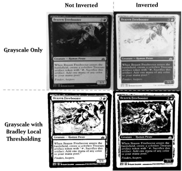
Figure 3: Diagram of the filters used while processing an image. A color image is converted using grayscale, Bradley local thresholding, and inverting filters to produce the image on the bottom right.

Tesseract functioned properly with the image in this state, but tests showed that inverting the image so that the text was white on a black background resulted in better accuracy. The effects of these filters can be seen below in Figure 3, where the final picture is the result after all three filters. Following rigorous testing and improvements, the final build processed the image using all three filters and increased accuracy to approximately 50%. All color types previously mentioned in section 2.4 were successfully converted to grayscale with no issues. It should be noted that this method was not tested on holographic cards.