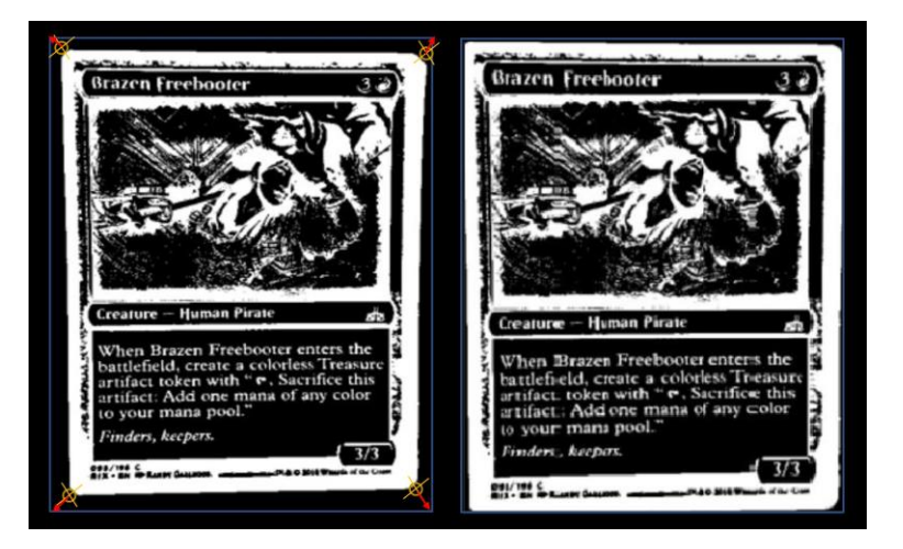
Figure 5: Image within virtual corners is stretched to fit image dimensions.

If the class succeeds in finding the four corner points the program passes those points and the previous blob rectangle to the Quadrilateral Transformation filter provided by AForge [9]. The Quadrilateral Transformation filter takes four points from an image and will stretch the area within those points to fit the specified image size. This filter then transforms an askew non-rectangular card image into fixed, square, and level image. This allows for easy text image cropping based on a fixed ratio relative to the image's size. An example of this transformation can be seen in Figure 5.