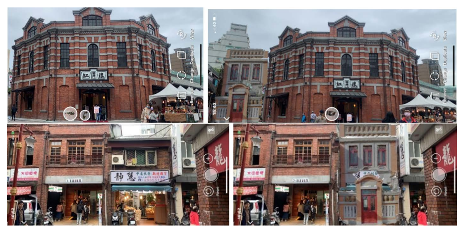
Figure 6: The original historical building (left) and a newly overlaid building façade for comparison

A comparison, which is made in a real environment with selected movement to orient oneself, helps positioning a user under the inspection mode similar to how the original craftsperson conducted building examinations a long time ago. The relative scale between the real building and the crowd is very helpful in estimating dimensions during daytime and in the evening. Interestingly, the weather and luminous condition of the site where a comparison was made becomes part of the reality. The diversity of the possible appearances of the studied subject now is of concern, since the façade can be different in a sunny or a raining day. A series of AR versions was created associated with matching scenarios. The openness of a complete AR app actually enriched the definition of reality.