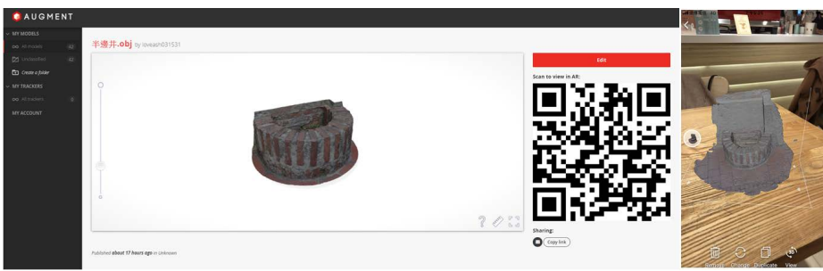
Figure 5: Assign a model on web version using QR Code (left) and browse on a smartphone (right)