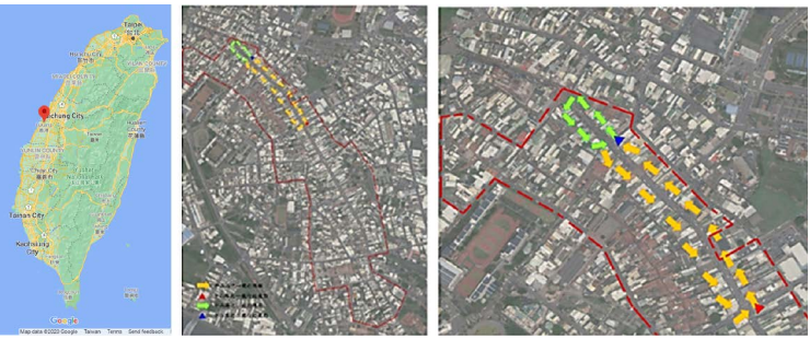
Figure 1: Lukang (left) and UAV planned path (right)

Heritages in Lukang are closely related to historical landscape, humanity, and building styles with the preservation well-conducted for a long time. The well-known old streets, where are full of relics, are part of the Heritage Preservation District mainly made of the Zhongshan Road, Zhongzheng Road, and peripheral districts. Based on former government promotion strategies, cultural industry has been evolved with unique characteristics and makes Lukang a famous tour site in central Taiwan. This site is full of characteristic foods, handcrafts, or religions. All the temples, shops, and food booths are connected to historical blocks in a unique circulation pattern. In order to document the famous old streets, we applied 3D photogrammetric modeling of the Zhongshan Road using an unmanned aerial vehicle (UAV) (Figure 1).