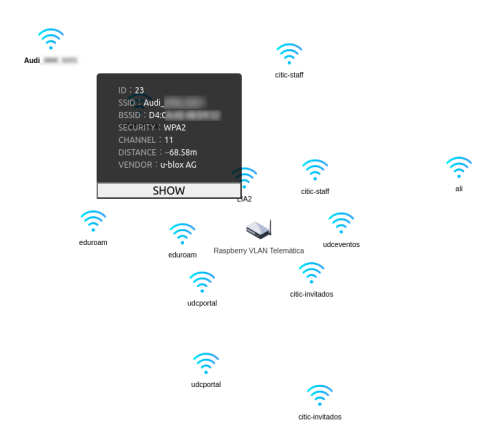
Figure 1: Web application: WiFi map

Among the different functionalities of the web application, we can highlight the detailed visualisation of all the information collected in each network analysed. On the other hand, it automatically creates executive reports that summarise the security status of each company and displays different types of graphs that help to understand the data collected. In addition, from the web interface itself, we can modify the configurations of any sensor that we have deployed in the network of any company. Figure 1 shows an example of the web application, showing the result of a WiFi analysis.