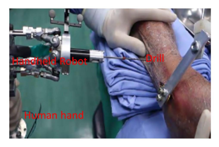
Figure 1: Handheld robot for bone drilling assistance in a cadaver test

Figure 1 shows the overall schematic of the handheld robot system for bone drilling. The mechanical structure is simple. The robot interacts with both the human and anatomical object through the handle and the effector of the robot respectively. Two force sensors are embedded at the handle and the cutter to measure the human exerted force and bone drilling force, respectively. The velocity command was then computed by the admittance controller for the robot controller. The motion of the control handle is positioned by the surgeon, while the surgical tool driven by the robot end-effector. The coordination between the human operator and the robot was designed so that the bone drilling can be performed more effectively than only image-navigation scenario.