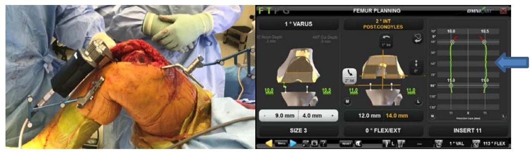
Figure 1 a) The BalanceBot is inserted into the knee after the tibial resection but before femoral resections. b) femoral planning is performed with predictive gap curves (blue arrow) to achieve a balanced knee throughout the range of motion.

The full surgical technique has been previously described using the Omni Apex knee, OmniBotics navigation system and BalanceBot automated distraction device (Corin USA, Raynham MA) [3,5]. The BalanceBot is inserted into the knee after the tibial cut in a tibia-first technique and before any ligament releases (figure 1a). The device applies a known, computer-controlled distraction force while the knee is taken through a range of motion. The gaps are characterized in the medial and lateral compartments from full extension through more than 90 degrees flexion. Femoral cut planning is then carried out with an instant display of the predicted gaps and laxity profile (Predictive Balance<sup>TM</sup>) based on virtual manipulation of the femoral component in all planes (figure 1b). After femoral cuts, results are confirmed when the femoral trial is in place using the BalanceBot as a virtual tibial trial that assesses the laxity profile, compartment pressures and knee kinematics through the continuous range of motion.