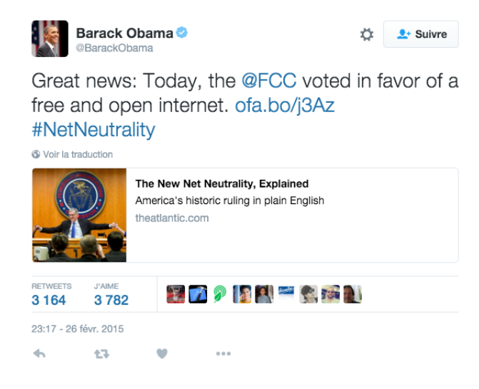
Figure 6: A second tweet from the US President

We will take as an example a message posted by the President of the United States, Barack Obama, about the net neutrality and the FCC.