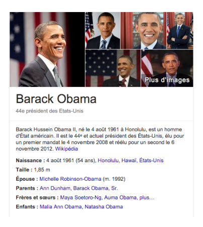
Figure 4: Google suggestion (in Wikipedia) for "President Obama"

This allows me to substitute the bi-gram "Barack Obama" to the bi-gram "President Obama". This resolves an ambiguity regarding DBPedia and validates the message.