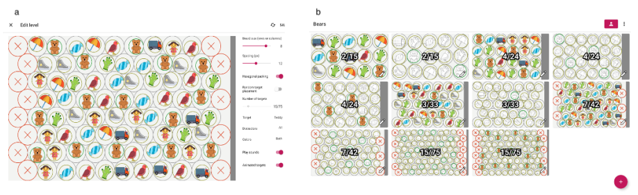
Figure 1: (a) Configuration screen (b) Main screen of the app, showing a grid of configurations.

The Digital Teddy app was developed for the Android operating system. Since the original test was made in an A4 sheet of paper, a good device for comparison with the TBCT would be a tablet with a screen diagonal of 14 inches and an aspect ratio of 4:3, which would result in a screen of 213x284 mm, very close to that of an A4. The examiners can create tests or edit an existing of one using the interface showed in Figure 2, which contains a large number of options: number of rows or columns, random placement of targets and distractors, etc.